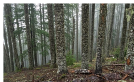
Western Hemlock, Douglas-fir, Cascade Oregongrape, Western Swordfern, and Oregon Oxalis