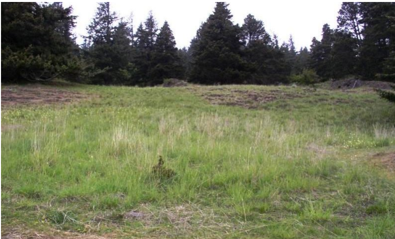
Figure 7. Bald #1