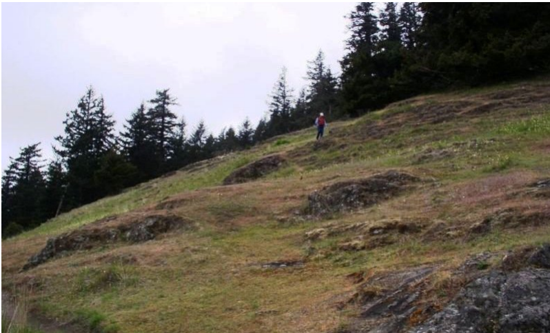
Figure 6. Rock Outcrop Bald