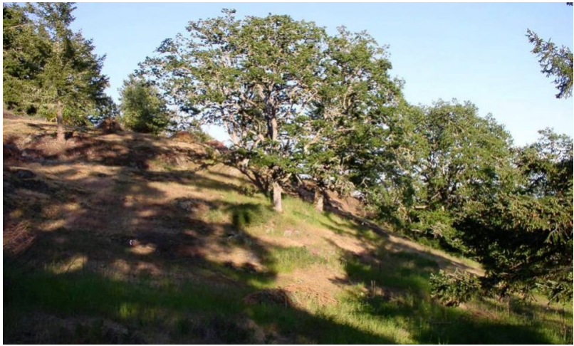
Figure 8. Bald with Garry Oak