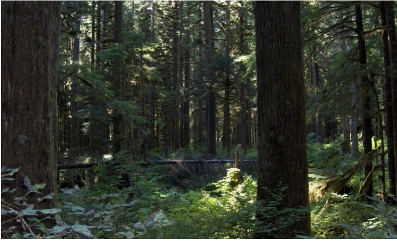
Figure 5. Reference Community

Structure: multistory with small gap dynamics. Western hemlock is the most common overstory species in the historic climax plant community. Western redcedar and Douglas-fir will both be present but there will be minimal Douglas-fir regeneration; grand fir and bigleaf maple would be much smaller components. The dense canopy created by multiple age groups of hemlocks may block most of the sunlight from the forest floor, leading to a sparse understory in some areas. At times vine maple will have this same effect where it grows in thick clumps. Gaps in the mid-canopy and overstory which allow sunlight to reach the ground are where the majority of the understory plants would be found. If there is no mid-canopy the understory will be more continuous. The most common natural disturbance on these sites would be the small gap dynamics following the death of one or two trees. Understory species included in the Canopy Cover Summary table had at least a 50% rate of constancy in 68 inventory plots. For specific data contact site author or your local NRCS office.