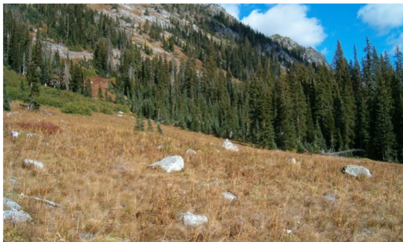
Figure 5. Reference Community (in background)

Structure: multistory with small gap dynamics. Community Phase 1.1 - Reference Community. Both subalpine fir and Engelmann spruce are slow growing species at these elevations. When small natural disturbances occur (the death of one or two trees) infill by seedlings will take several decades, sustaining the multistory structure of the Reference Community. Subalpine fir and Engelmann spruce are susceptible to different rot-causing organisms (e.g. Gloeocystidiellum radiosum for Engelmann spruce and Gloeocystidiellum citrinum for subalpine fir). The presence of one of these organisms can shift the composition of the forest away from its host species. Clumps of thimbleberry and Sitka mountain-ash will be the main taller shrubs while the rest of the shrub species are low-growing species such as pachistima, princes pine and dwarf bramble.