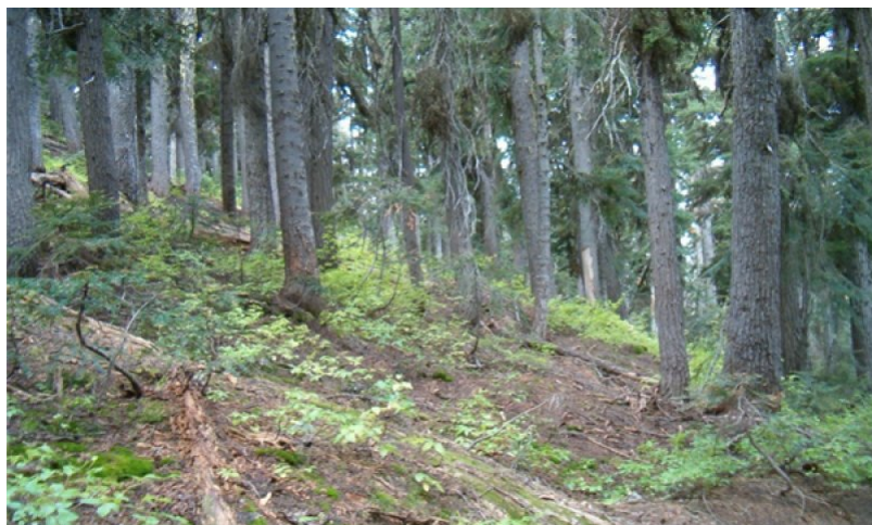
Figure 5. Reference Community

Structure: multistory with small gap dynamics. Pacific silver fir and Engelmann spruce are the dominant overstory species in Community Phase 1.1 - Reference Community. Subalpine fir, western hemlock and Douglas-fir can all be minor overstory components. The amount of canopy cover will affect the continuity of the shrub layer; typically the canopy becomes less dense at the upper elevations of this ecological site. The most common natural disturbance on these sites would be the small gap dynamics following the death of one or two overstory trees, allowing for the release of advanced regeneration and/or an increase in the understory shrub community.