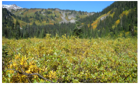
Alaska Cedar, Sitka Alder, Barclay's Willow, and Five-leaved Bramble

This pathway represents growth over time with no further significant disturbance. The areas of regeneration go through the typical phases of stands, including competitive exclusion, maturation, and understory reinitiation, until they resemble the old-growth structure of the reference community.