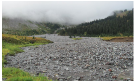
Barclay's Willow and Fireweed

This pathway represents a major 100- or 500-year flood that results in complete or nearly complete loss of the overstory.