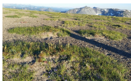
Black Sedge and Alpine Timothy

This pathway represents major disturbances, such as continuous snowpack, avalanches, landslides, and slower mass movement, that remove most of the vegetation.