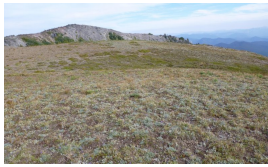
Davis' Knotweed and Arctic Lupine

This pathway represents an area with no further major disturbance. Continued growth over time has led to increased vertical diversification of forbs.