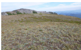
Davis' Knotweed and Arctic Lupine