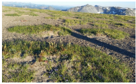
Black Sedge and Alpine Timothy