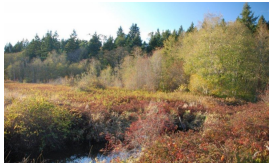
Grasses, Mosses, Grass-likes, and Shrubs.

This pathway may be caused one of two ways: 1) a lack of the natural fire regime which allows surface layers of undecomposed organic matter and moss to build up allowing for the establishment of a shrub community; or 2) an increase in the depth to water table due to a physical event such as the erosion of a natural impoundment structure.