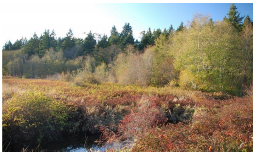
Figure 7. Community phase 1.2 - grasses, mosses, grass-like

Like the Reference Community, this community phase also supports predominantly grass-like plants, grasses, forbs and moss. However, the water table during the growing season is typically near to below the soil surface, allowing species which require better drainage conditions to establish in the site. This slightly lowered water table can result from a buildup of organic matter on the surface into which plants can root, or erosion of materials which hold water on the site, such as beaver dams or landslide or other debris. Control of fire will also promote development of this community. Common plants present on the site include many shrubs and less water-tolerant herbaceous species.