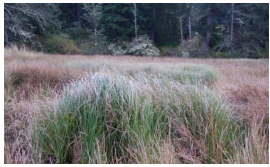
Grasses, Mosses, Sedges, and Rushes