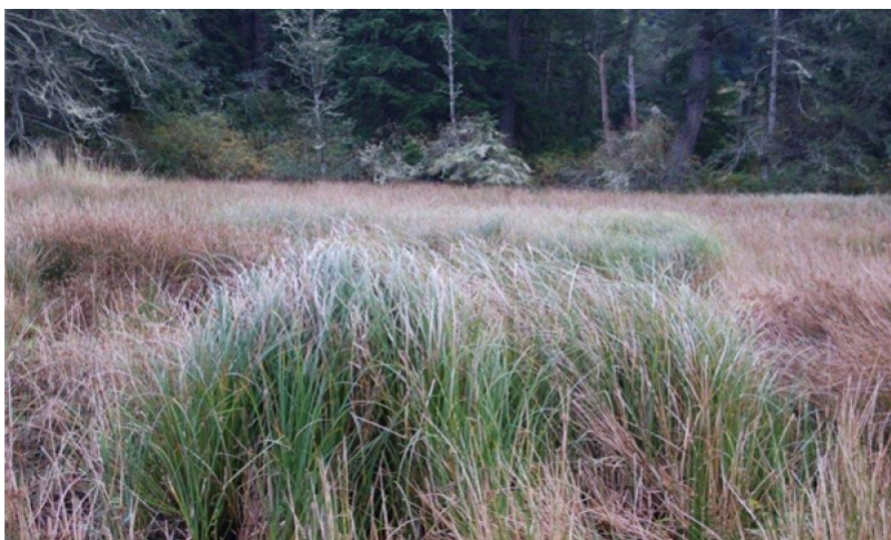
Figure 5. Reference Community

The Reference Community phase is characterized by a water table present during the growing season near or above the soil surface, although better-drained hummocks can occur in the site. Vegetation is characterized by a predominance of grass-like plants, grasses, forbs and moss. Species present and their percent cover in any