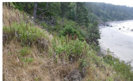
Canada Goldenrod, Common Yarrow, Pacific Reedgrass and Red Fescue

This pathway represents a major stand-replacing disturbance such as a high-intensity fire, a large-scale wind event, or large mass movement that leads to the stand initiation phase of forest development.