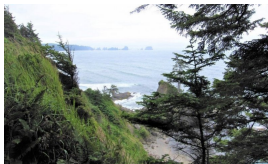
Sitka Spruce, Shore Pine, Salal, Evergreen Huckleberry, False Lily of the Valley, and Western Brackenfern