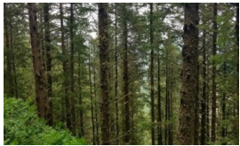
Sitka Spruce, Western Hemlock, Salmonberry, Salal, Western Swordfern, and Common Ladyfern