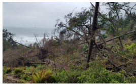
Red Alder, Red Elderberry, Salmonberry, Western Swordfern, and Coastal Hedgenettle

This pathway represents a major stand-replacing disturbance such as a high-intensity fire, timber management, a large-scale wind event, a major insect infestation, or large mass movement that leads to the stand initiation phase of forest development.