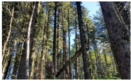
Sitka Spruce, Western Hemlock, Salal, Salmonberry, Western Swordfern, and False Lily of the Valley