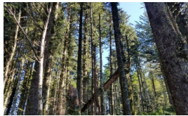
Sitka Spruce, Western Hemlock, Salal, Salmonberry, Western Swordfern, and False Lily of the Valley

This pathway represents growth over time with no further major disturbance.