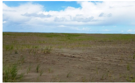
Coastal Sand Verbena, American Searocket, and American Dunegrass