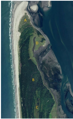
Figure 1. Ecological sites of the coastal/beach zone in LRU B of MLRA 4A. The area designated as “A” is the Foredune Scrub and Grassland site, “B” is the Dune Forest site, “C” is the Aquic Interdune site, and “D” is the Tidal Marsh and Estuary site.