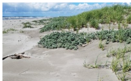
Beach Pea and American Dunegrass