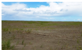
Beach Pea and American Dunegrass