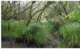
Hooker Willow, California Wax Myrtle, Pacific Silverweed, and Slough Sedge

This pathway represents a climatic change toward wetter conditions. If the site becomes wetter from excessive ponding or flooding, the depth to a water table will decrease. This will impact the growing season and alter the plant community.