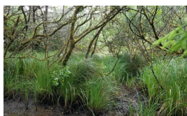
Hooker Willow, California Wax Myrtle, Pacific Silverweed, and Slough Sedge

This pathway represents a climatic change toward drier conditions. If the site becomes drier from reduced precipitation, the depth to a water table will increase and the duration and frequency of ponding will decrease. This hydrologic change will alter the plant community.