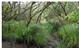
Hooker Willow, California Wax Myrtle, Pacific Silverweed, and Slough Sedge