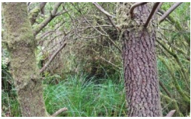
Sitka Spruce, Shore Pine, Hooker Willow, California Wax Myrtle, and Slough Sedge