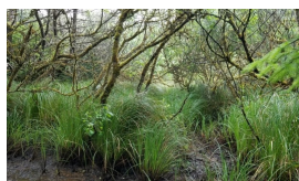
Hooker Willow, California Wax Myrtle, Pacific Silverweed, and Slough Sedge