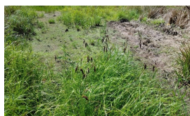
Pacific Silverweed, Salt Rush, and Slough Sedge