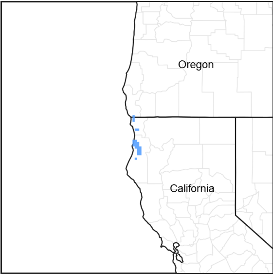
Figure 1. Mapped extent

Provisional. A provisional ecological site description has undergone quality control and quality assurance review. It contains a working state and transition model and enough information to identify the ecological site.