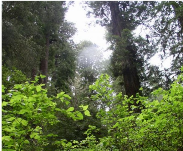
Figure 9. Salmonberry-Western swordfern

The redwood/western swordfern plant community could develop by using active management and removing the red alder. Redwood continues to grow and responds by filling in canopy gaps. The estimated tree age for this site ranges from 35 to 70 years. Remnants of salmonberry remain, but have less cover due to canopy closure. Western swordfern and redwood-sorrel remain the dominant forb cover. Community Pathway 1.4a: Over several hundred years, and with no significant disturbance, this plant community could be expected to return to the multi-storied redwood plant community seen in PC 1.1. Community Pathway 1.4b: If the redwood/red alder are block harvested, alder and salmonberry would likely infill, transitioning this plant community to PC 1.2. Community Pathway 1.4c: As other shade-tolerant conifers infill and grow, the population of western hemlock could potential increase at the site, and transition PC 1.4 to PC 1.6.