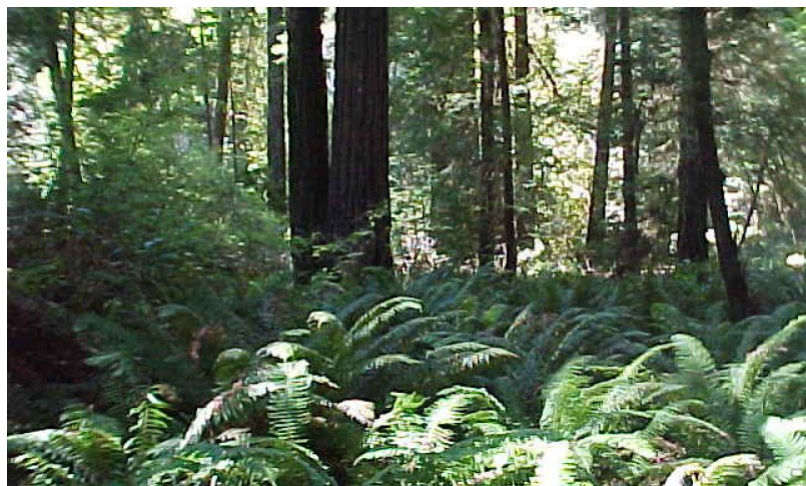
Figure 8. sese