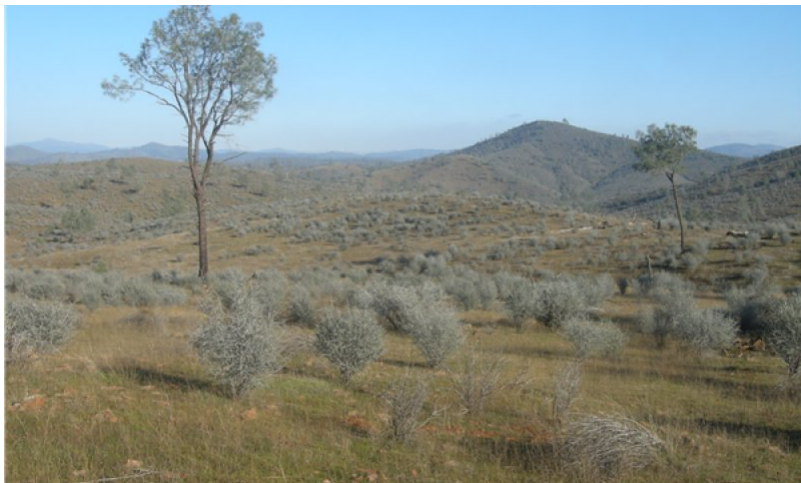
Figure 10. Community Phase 1.2, with buckbrush seedlings in post-fire community; Photo: C. Savastio, 2011.