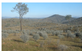
Post-fire plant community

This pathway occurs after patchy, low to moderate severity fire.