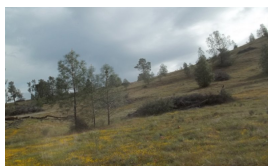
Cleared shrub community

Mechanical removal of woody vegetation before the buckbrush have matured may move the community into this phase. This pathway might also occur when intensive grazing occurs early in the post-fire community phase. The combined effects of burning and heavy grazing on buckbrush stands often will stress the establishing shrubs and thus convert shrubland into a grass-forb dominated community (see Biswell, 1963).