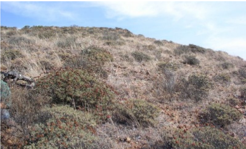
Figure 4. Santa Cruz Island Buckwheat