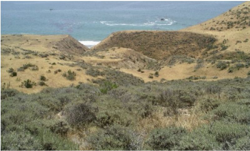
Figure 9. Coastal Sagebrush Scrub

The coastal sagebrush community can invade either the native grasslands or the non-native annual grasslands when the disturbance from grazing and fire is removed. Invasion of coastal sagebrush into the native grasslands is uncommon and different from the recovery of coastal sagebrush in its historical territory. Coyotebrush ( Baccharis pilularis ) often invades first, with California sagebrush coming in afterwards. See the coastal sagebrush ecological sites R020XI100CA and R020XI113CA for more information on this community.