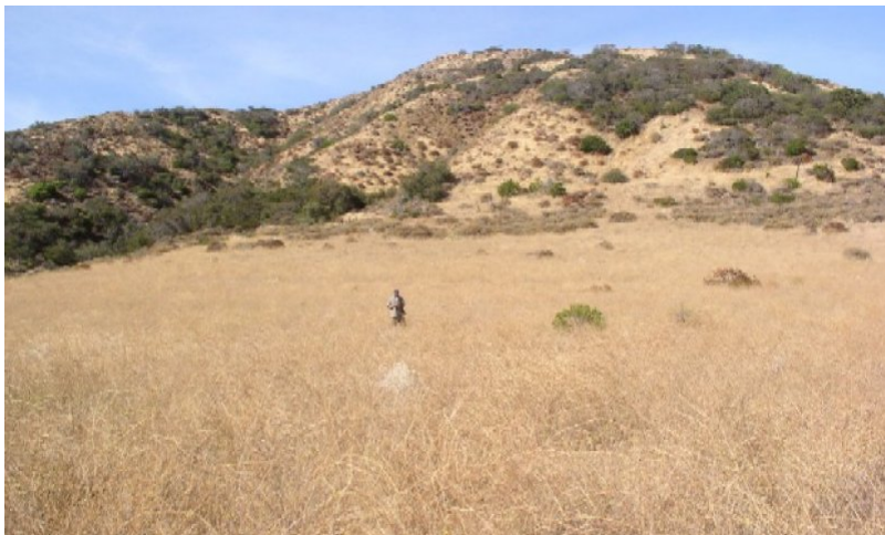
Figure 8. non native invasive forbs

This community was dominated by non-native grasses, but increasingly became invaded by yellow star-thistle ( Centaurea solstitialis ), Maltese star-thistle ( Centaurea melitensis ), black mustard ( Brassica nigra ), shortpod mustard ( Hirschfeldia incana ), sweet fennel ( Foeniculum vulgare ), horehound ( Marrubium vulgare ), and many others. These Mediterranean species are extremely difficult to eliminate. Of these weeds, yellow star-thistle ( Centaurea solstitialis ) has the greatest ability to alter the soil's water recharge and depletion pattern within the grasslands (Enloe et al., 2003). Yellow star-thistle has been shown to have a drier soil profile than that of either the non-native annual grasses or the native perennial grasses, and continues to deplete the soil's water later into the season, and to greater depths than either of the grass communities studied. This can cause a drought-like condition for the grasses even in a normal water year. Community Pathway 3.2: The shift from PC 3.2 back to PC 3.1 could occur after an extended time without disturbance, and in conjunction with extensive restoration efforts to remove the yellow star-thistle.