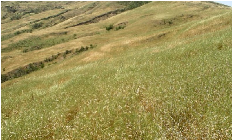
Figure 6. non native annual grassland

The non-native grassland community is common through out California. The primary species are slender oat ( Avena barbata ), wild oat ( Avena fatua ), ripgut grass ( Bromus diandrus ), soft brome ( Bromus hordeaceus ), and Spanish brome ( Bromus madritensis ). The annual production for the non-native annual grasses is precipitation dependent, and highly variable. Site specific factors such as aspect, soil moisture, marine influences, and landscape position also influence annual production. Community Pathway 3.1: The shift from PC 3.1 to PC 3.2 may be linked to severe pig disturbance and the introduction of non-native Mediterranean species. The seeds of the most invasive of these species, yellow star-thistle, are easily spread by car tires, hikers' socks and shoes, and by wildlife, all of which can cause infestation of new areas. Transition 4: In the absence of disturbance from fire or grazing, coastal sagebrush can slowly encroach into PC 3.1, leading to state 4. This tends to be a rare transition.