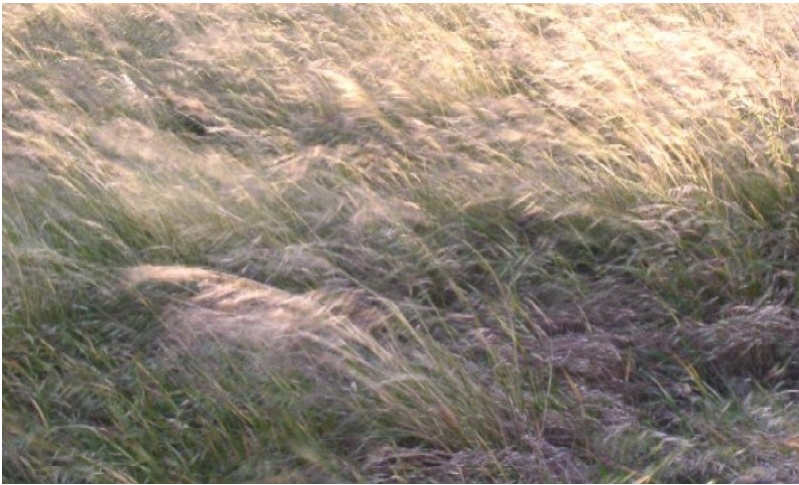
Figure 4. Native Grassland