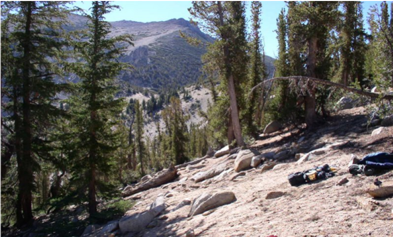
Figure 8. Mature, open mountain hemlock- whitebark pine

This phase is dominated by a canopy of mountain hemlock co-dominated by taller primarily single-stem whitebark pines. Canopy cover ranges 20 to 45 percent. Overstory canopy height ranges from 35 to 55 feet with ages of 150 to 500 years old. Western white pine ( Pinus monticola ) and California red fir may occur in limited amounts. The understory is dominated by litter, gravel, and rock with low cover of graminoid, herbaceous and subshrub species.