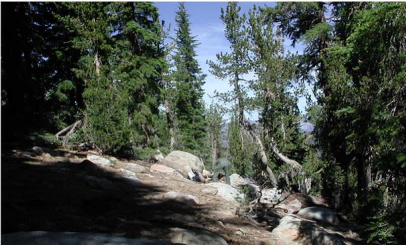
Figure 7. Closed mountain hemlock forest

This state represents the reference conditions for this ecological site. A portion of this ecological site exists in this state in stands that do not show symptoms of WPBR.