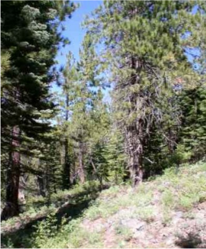
Figure 7. Community Phase 1.3

This forest community phase develops under a natural fire regime, which can be emulated with manual thinning and prescribed fires. Low to moderate intensity fire clears the understory and removes fuels before they reach hazardous levels. Severe, high-intensity canopy fires are rare but possible.