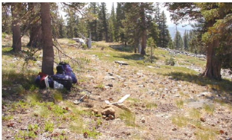
Figure 7. Community Phase 1.1

This community phase represents the most successional advanced community for this ecological site. It is fairly undisturbed by human influences because of its inaccessibility. Sierra lodgepole pine has an open canopy, with several age classes. California red fir and western white pine are present in small amounts, but will not successional replace Sierra lodgepole pine on this site due to the root restrictive till layer and possibly frost issues. The trees in this forest are commonly over 200 years old, but are slow growing due to harsh environmental variables such as a short growing season and low soil fertility. An estimate on life span for this community phase ranges from 125 to more than 500 years.