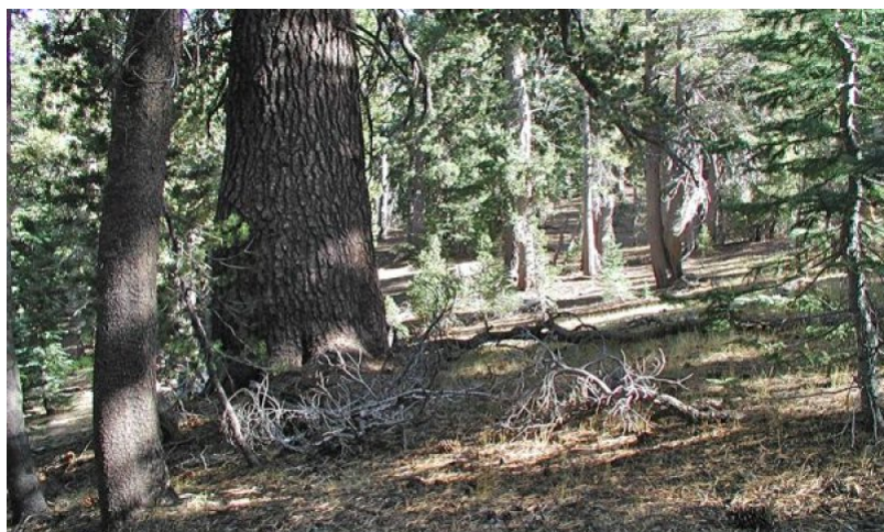
Figure 7. Community phase 1.1

This plant community phase is fairly undisturbed by human influences because of its inaccessibility, so this old growth subalpine mixed conifer community phase is representative of the most successional advanced phase. Mountain hemlock, Sierra lodgepole pine, California red fir, and western white pine create a relatively dense multi-layered forest. The trees in this forest are commonly over 200 years old, and are slow growing due to the short growing season on cool high elevation slopes. An estimate on age for this community phase ranges 125 to more than 500 years.