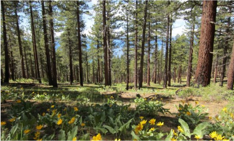
Figure 7. Community Phase 1.3

This forest community phase develops with the natural fire regime, or with manual thinning and prescribed fires. Low to moderate intensity fire clears the understory and removes fuel before it reaches hazardous levels, although severe high intensity canopy fires are also possible. If Jeffrey pine and sugar pine established during stand initiation they will have a fair percentage of cover in the upper canopy, but Jeffrey pine and sugar pine will have difficulty regenerating and growing well in the understory of the canopy. Their growth and presence is dependent upon fire or other disturbances to maintain an open canopy forest structure. The young forest community phase is a heavily managed forest. Manual thinning and prescribed burns reduce the white fir component, reduce fuel loads, and create canopy openings in the forest. Natural fires are, for the most part, quickly extinguished in this forest because of its proximity to urban areas.