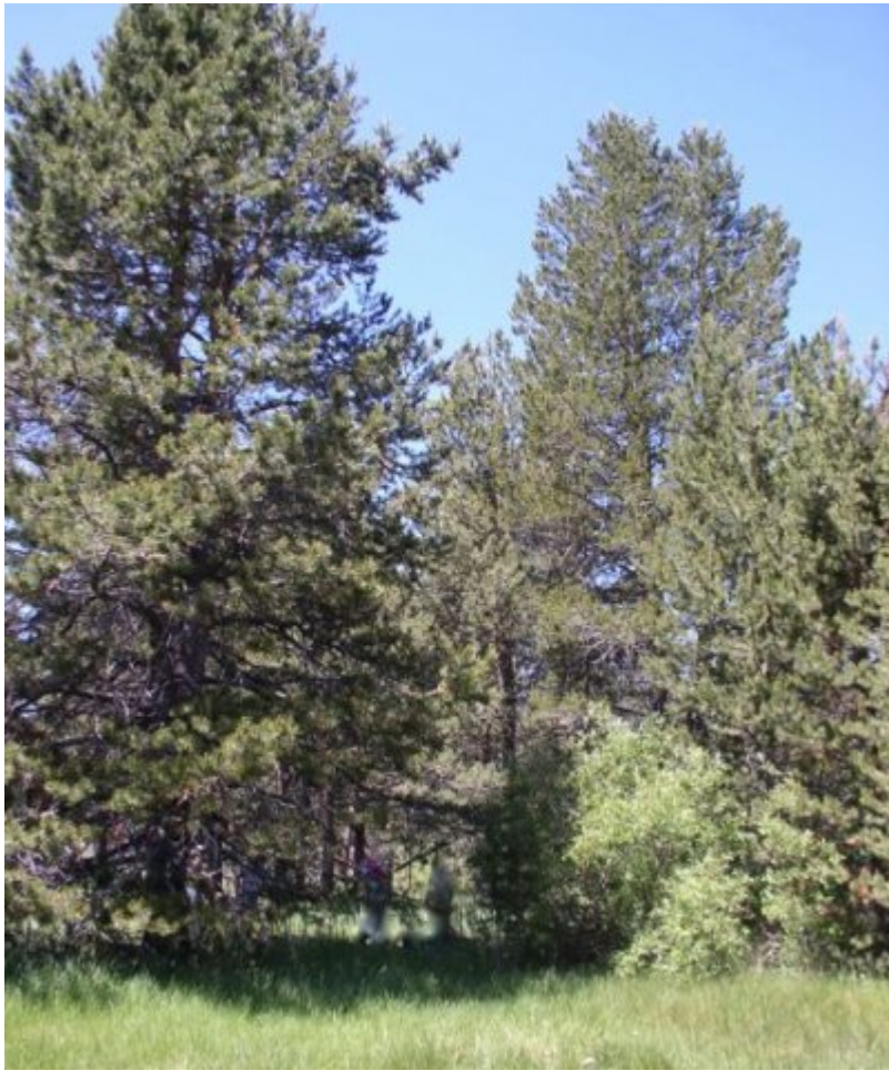
Figure 7. Community Phase 1.1

The historic most successional advanced community phase was presumed to be open old-growth stands of predominantly Sierra lodgepole pine occasional scattered white fir, Jeffrey pine and incense cedar, with establishment of secondary conifers limited by frost and high water table levels. The age for this community is estimated to have ranged from 100 to more than 200 years between disturbances. Stand-replacing fires would have initially established an even-aged forest. However, minor disturbances, such as windfall and insect infestation would have eventually led to openings, tree regeneration, and a mosaic of developing small stands forming an overall multi-aged forest. The understory cover was probably moderate in the openings with Lemmon's willow, grasses, and sedges making up the majority of species.