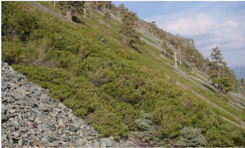
Figure 7. Reference Plant Community

The reference community is montane chaparral dominated by huckleberry oak. Greenleaf manzanita may be locally abundant. Common secondary shrubs present at lower cover include whitethorn ceanothus ( Ceanothus cordulatus ), bitter cherry ( Prunus emarginata ), bastardsage ( Eriogonum wrightii ), roundleaf snowberry ( Symphoricarpos rotundifolia ), sulphur-flower buckwheat ( Eriogonum umbellatum ), Utah serviceberry ( Amelanchier utahensis ), and wax current ( Ribes cereum ). Tree, forb and grass cover is typically insignificant. Trees that may occur on the site include Jeffrey pine ( Pinus jeffreyi ), California red fir ( Abies magnifica ) and Sierra lodgepole pine ( Pinus contorta ssp. murrayana ).