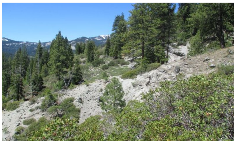
Figure 7. Community Phase 1.1