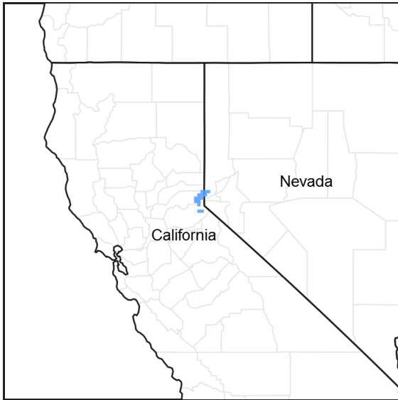
Figure 1. Mapped extent

Provisional. A provisional ecological site description has undergone quality control and quality assurance review. It contains a working state and transition model and enough information to identify the ecological site.