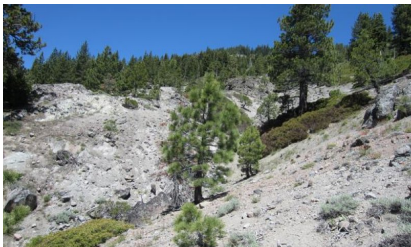
Figure 8. Community Phase 1.1

Patchy chaparral cover, a diverse forb community, and a high cover of bare ground characterize the reference plant community. Average shrub cover is 30 percent, which is dominated by huckleberry oak and greenleaf manzanita. The shrub community is diverse, with up to twelve different species typical. Prostrate ceanothus ( Ceanothus prostratus ), Utah serviceberry ( Amelanchier utahensis ), are important secondary shrubs, and pinemat manzanita ( Arctostaphylos nevadensis ), bitter cherry ( Prunus emarginata ), roundleaf snowberry ( Symphoricarpos rotundifolius ), creeping snowberry ( S. mollis ), and Sierra gooseberry ( Ribes roezlii ) are among the frequently encountered secondary shrubs, but other species may also be present. Trees are scattered and patchy, and favor concave microsites where there is additional run-on and soil accumulation, or colonize shrub patches where there is shade and soils are stable. Prostrate ceanothus is a nitrogen fixing species that can act as a nurse plant for trees and other shrubs (Brown et al. 1971). This site is surrounded by Jeffrey pine ( Pinus jeffreyi ) - white fir ( Abies