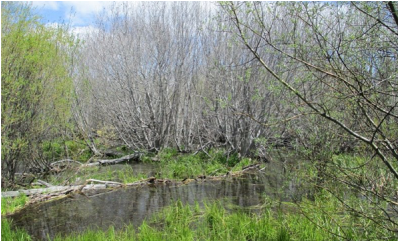
Figure 7. CC2