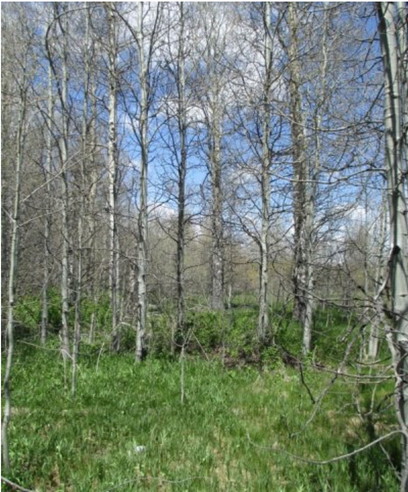
Figure 10. CC6