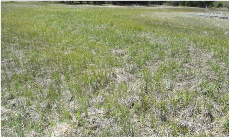
Figure 8. CC3