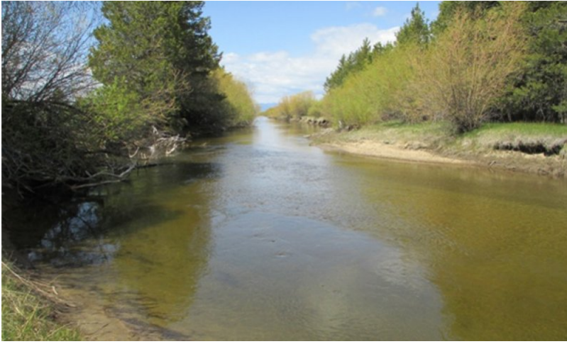
Figure 14. Straightened Channel by Tahoe Keys