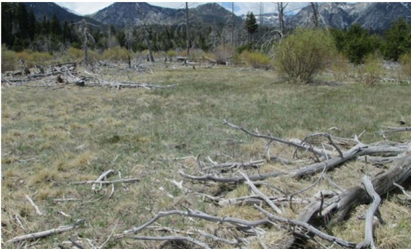
Figure 11. CC7