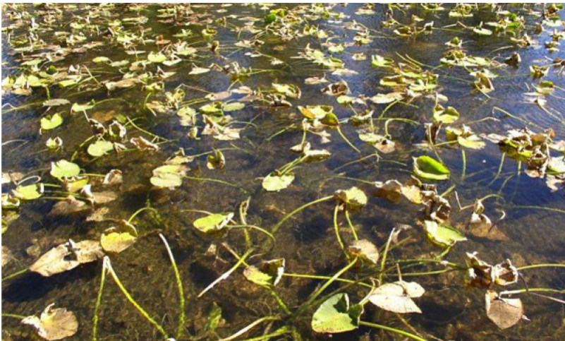
Figure 12. CC1