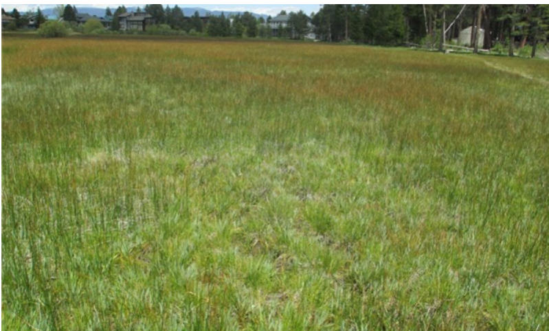
Figure 9. CC5