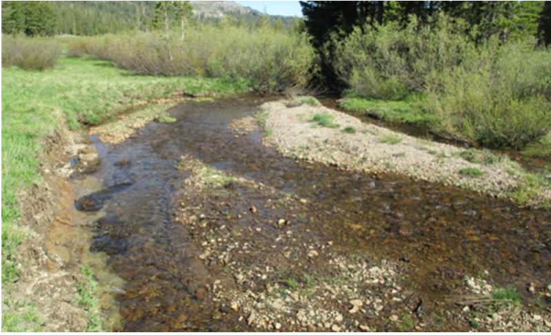
Figure 11. F Channel