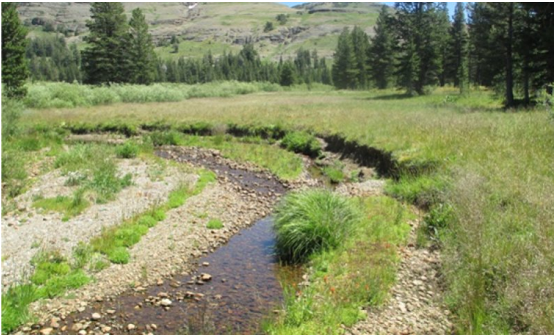
Figure 12. F Channel to C channel

The F type channel is wide, shallow and incised, with unstable actively eroding banks. Community components and community composition is similar as described in the G type channel phase. The wider channel and lack of vegetation on the banks, causes an exposed channel with little shade across the stream. Silt and sand from actively eroding banks causes a decline in habitat quality for fish and aquatic insects.