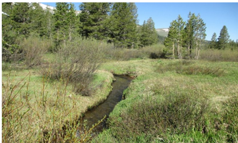
Figure 6. E channel