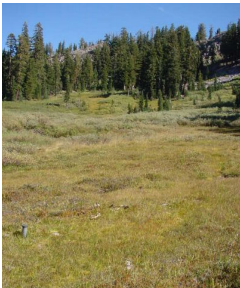
Figure 7. CT1 Discharge Slope