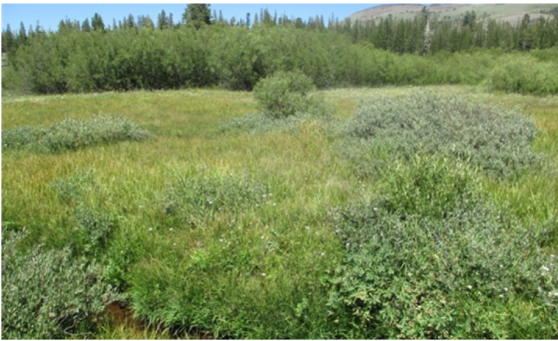
Figure 8. CT2 Floodplains