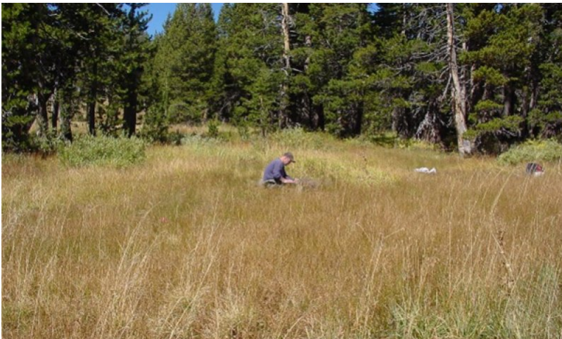
Figure 9. CT3 Floodplain Step