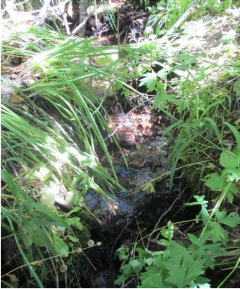
Figure 12. G Channel