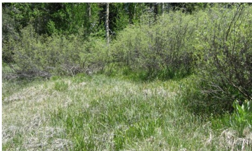
Figure 9. CC2