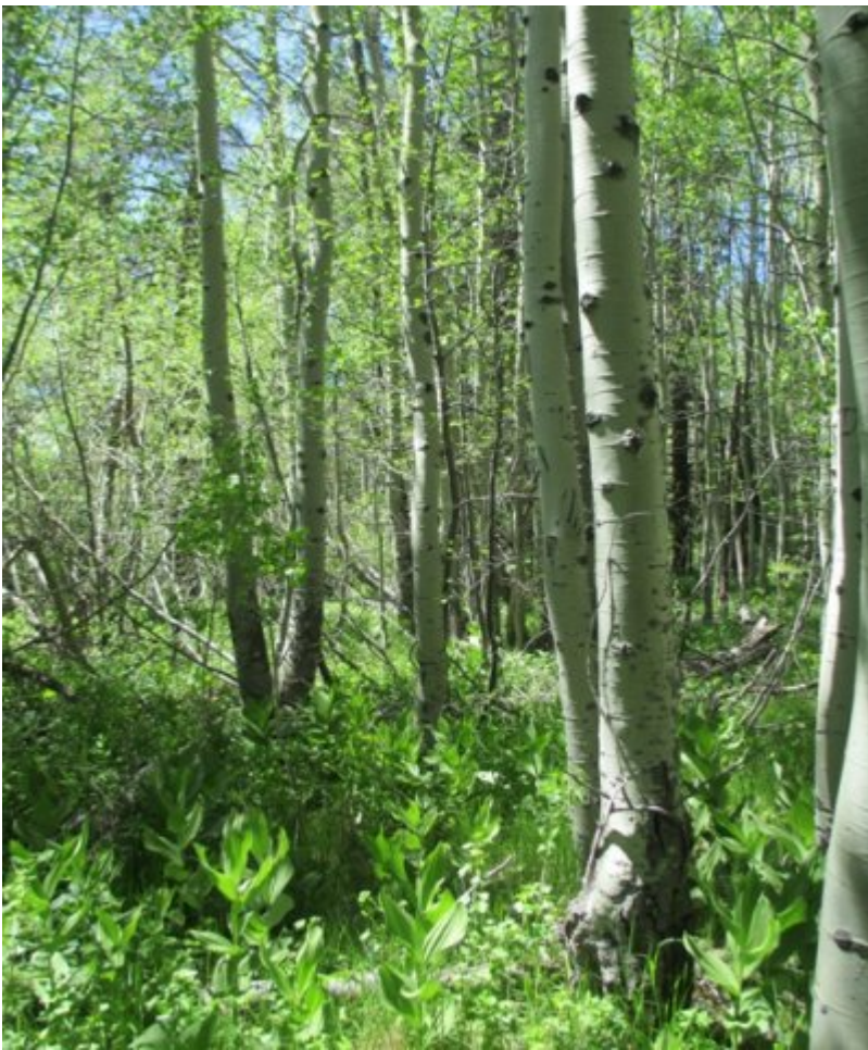
Figure 10. CC3