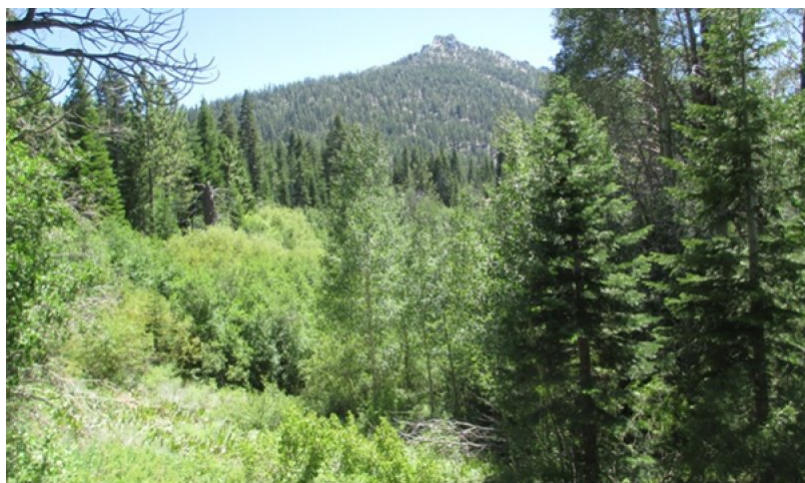
Figure 7. Area view