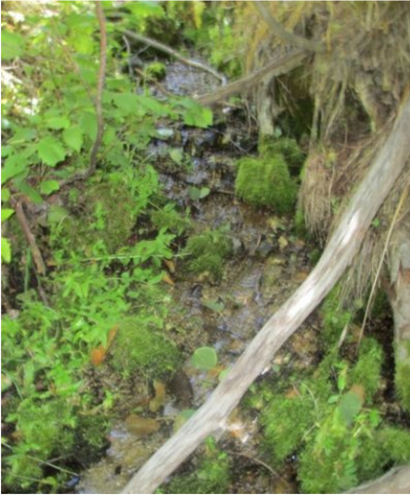
Figure 13. A Channel

This phase is defined with a stable A or Ba channel type. Due to the confinement of the channel, flooding does not occur on the meadow, CC2. In some areas these meadows may still have a connection to the spring or seep, and maintain high water tables throughout the year. Community composition remains similar to state 1, but CC2 may become drier and dominated by more upland species as identified in State 2.