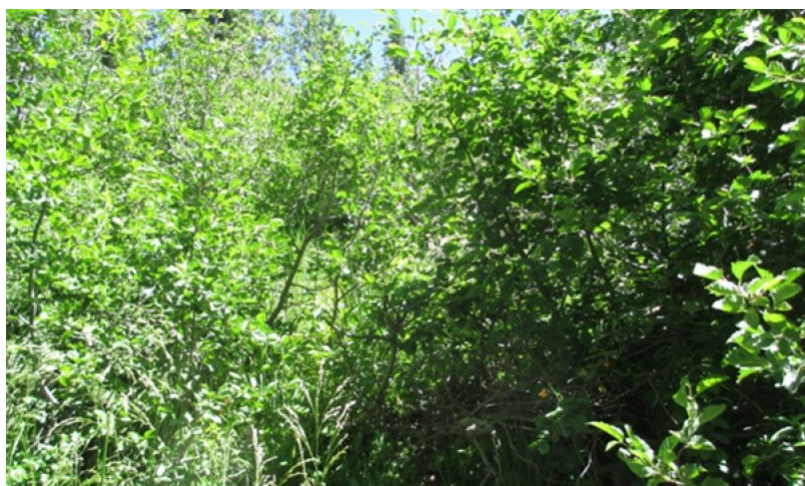
Figure 8. CC1