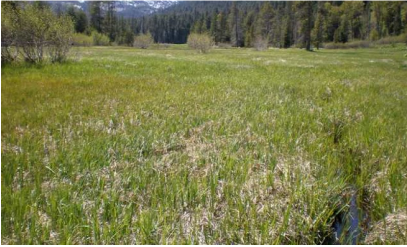
Figure 4. Frigid Alluvial Flat