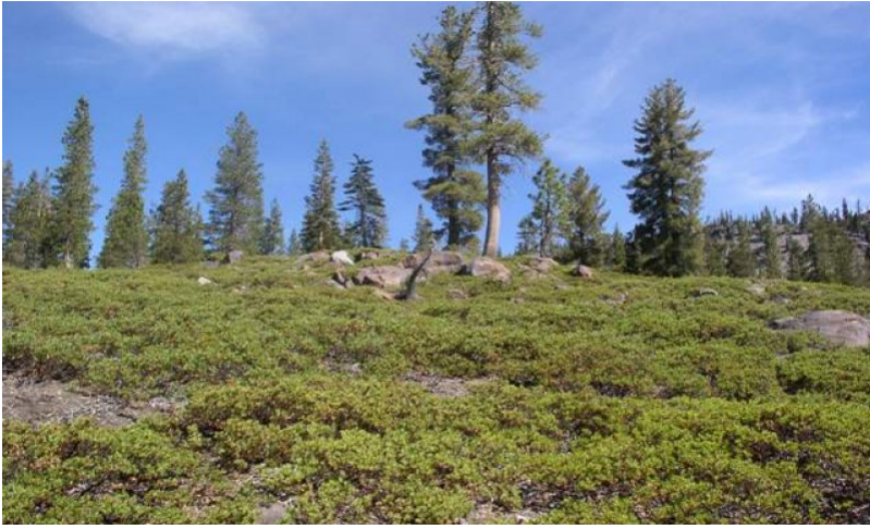
Figure 4. Glaciated Mountain Slopes

Community phase 1.1 is the reference community for this ecological site. It consists of scattered mature trees with an extensive understory of pinemat manzanita ( Arcostaphylos nevadensis ). Tree species include western white pine ( Pinus monticola ), California red fir ( Abies magnifica ), mountain hemlock ( Tsuga mertensiana ) and Sierra lodgepole pine ( Pinus contorta ssp. murrayana ). Large scale disturbances do not regularly occur on this site, creating the potential for plant community 1.1 to remain relatively unchanged for decades and possibly centuries.