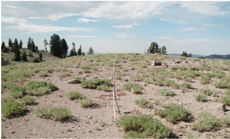
Figure 3. Cirque Floor