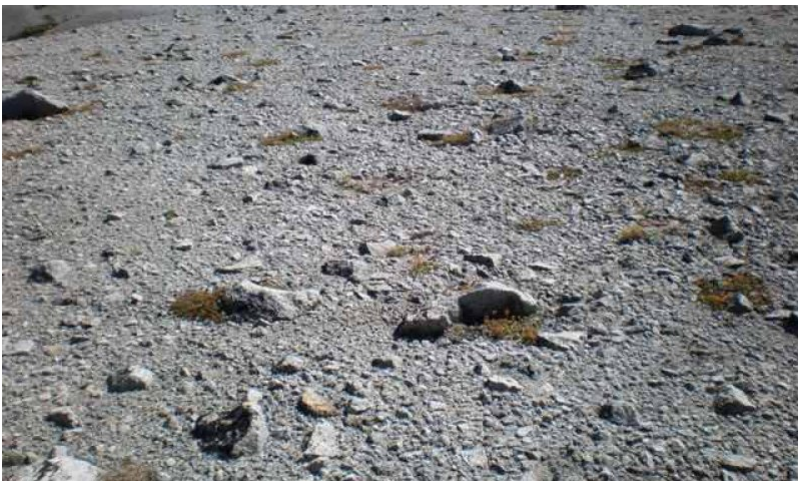
Figure 4. Pyroclastic Flow Ecological Site

Unique assemblages of prostrate alpine forbs are found across this site. Common species include marumleaf