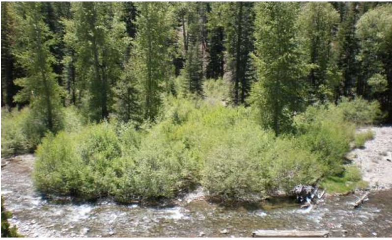
Figure 5. Gravelly Flood Plains