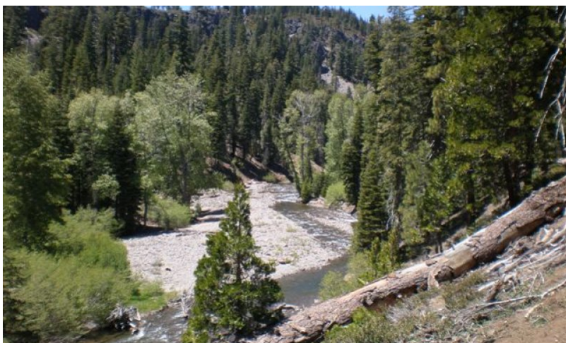
Figure 5. Gravelly Flood Plains, Kings Creek