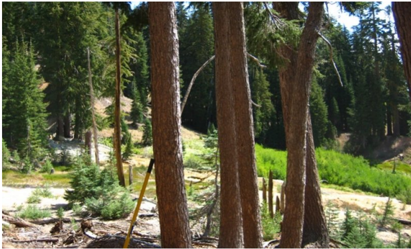
Figure 3. Relative stability-scattered mixed conifers

This site has the potential to develop patches of open California red fir-mixed conifer forest. Within the patches canopy cover may be up to 35 percent, but across the slope canopy cover is low, 5 to 25 percent. The debris flow material and the scarp face develop at different paces. The debris flow deposits, when stable, can develop tree patches earlier than the scarp face. The scarp face has shallower soils on steep exposed slopes, lose water quickly to drainage and evaporation. Mountain hemlock is common at the upper elevations of the site, while California red-fir and western white pine are more common at the lower elevations of this site.