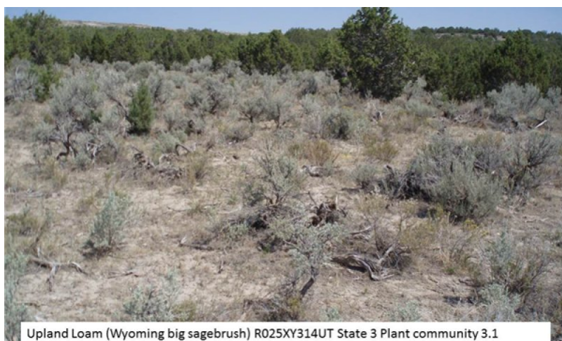
Figure 7. Photo State 3 Plant Community 3.1

This community has a strong overstory of Utah Juniper and Singleleaf pinyon but still has an understory similar to community 2.1. This community will have around 20 – 35% bare ground. Fire is the surest means to bring this community back toward the Current potential State.