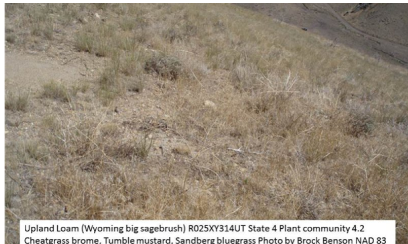
Upland Loam (Wyoming big sagebrush) R025XY314UT State 4 Plant community 4.2 Cheatgrass brome, Tumble mustard, Sandberg bluegrass NAD 83