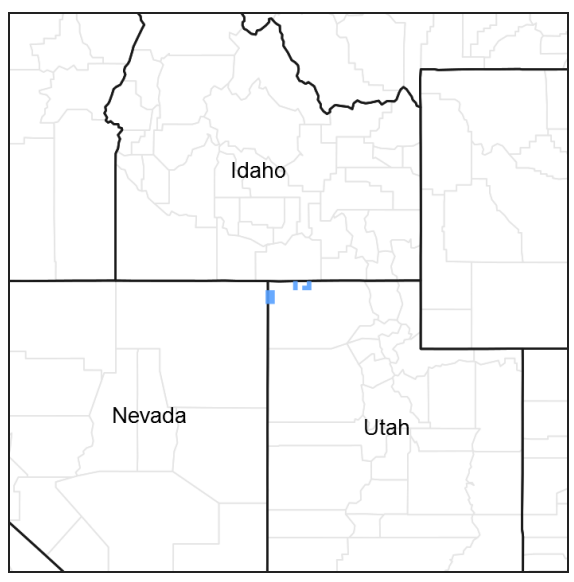
Figure 1. Mapped extent

Provisional . A provisional ecological site description has undergone quality control and quality assurance review. It contains a working state and transition model and enough information to identify the ecological site.