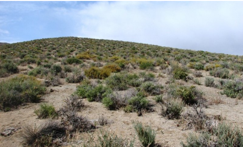
Figure 3. Granitic slope

Annual non-native plants such as cheatgrass or tansy mustard dominate the site. Rabbitbrush may or may not be present. Community Phase Pathway 4.1a: Time and lack of fire allows for the sagebrush to establish. Probability of sagebrush establishment is extremely low. Community Phase 4.2: Sprouting shrubs such as spiny hopsage and Rabbitbrush along with broom snakeweed dominate overstory. Big sagebrush may be a minor component. Annual non-native species dominate understory. Trace amounts of desirable bunchgrasses may be present. Bare ground is significant. Community Phase Pathway 4.2a: Fire eliminates shrubs and allows for annual non-native species to dominate the site.