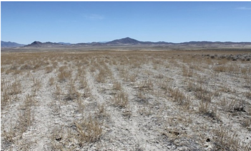
Figure 11. T.Stringham_5/2012, NV766, MU1522

This community is dominated by annual non-native species. Trace amounts of winterfat and other shrubs may be present, but are not contributing to site function. Bare ground may be abundant, especially during low precipitation years. Wind erosion and extreme soil temperatures are driving factors in site function.