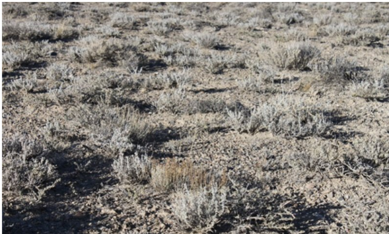
Figure 9. Coarse Silty 5-8", T.Stringham, May 2012, NV766 MU116