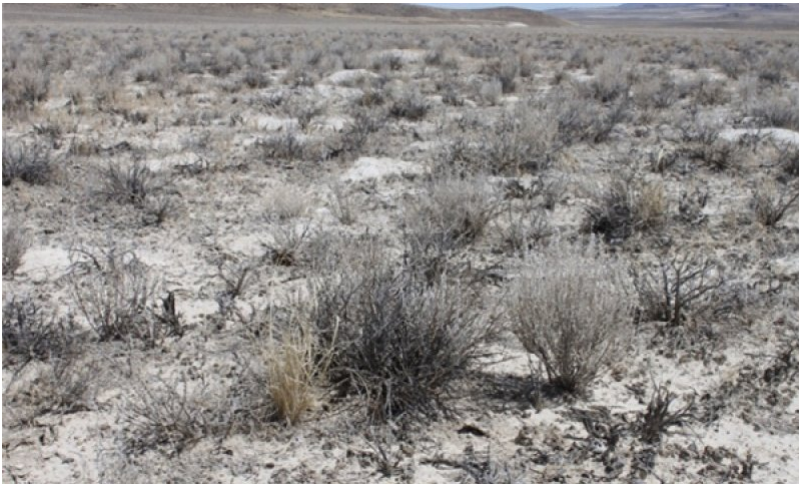
Figure 10. Coarse Silty 5-8", T.Stringham, May 2012, NV766 MU1522

Perennial bunchgrasses, like Indian ricegrass are reduced and the site is dominated by winterfat. Rabbitbrush ( Chrysothamnus spp.) and shadscale may be significant components or dominant shrubs. Annual non-native species increase. Bare ground has increased.