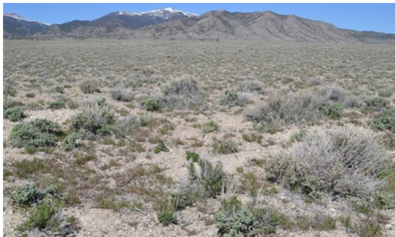
Figure 9. Gravelly Barren Fan (R028AY007NV). T.Stringham, April 2013

Pygmy sagebrush and other shrubs increase while Indian ricegrass and needleandthread grass decline. Bare ground increases along with annual weeds. Rabbitbrush may increase. Prolonged drought may lead to an overall decline in the plant community.