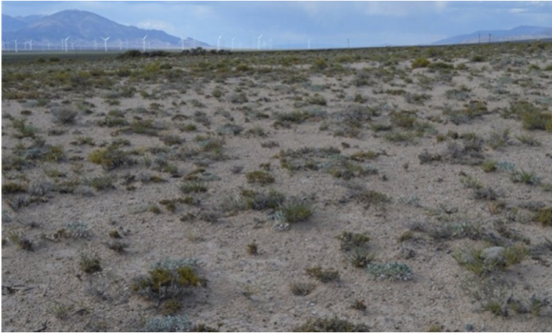
Figure 10. Gravelly Barren Fan (R028AY007NV). T.Stringham, August 2013

Decadent pygmy sagebrush dominates the overstory. Rabbitbrush and/or other sprouting shrubs may be a significant component. Mat-forming forbs may be significant component. Deep-rooted perennial bunchgrasses may be present in trace amounts or absent from the community. Annual non-native species increase. Bare ground is significant. Utah juniper may be present.