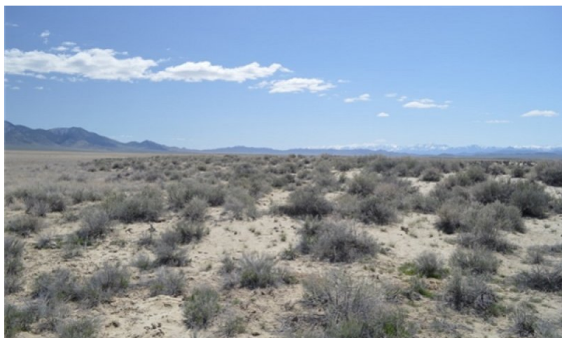
Figure 8. T.Stringham_4/24/2013, MU779_1390 Kawich soil series

Fourwing saltbush and other shrubs increase in the absence of disturbance. Excessive herbivory may cause an increase in black greasewood and other unpalatable shrubs. Fourwing saltbush and other shrubs dominate the overstory and the deep-rooted perennial bunchgrasses in the understory are reduced either from competition with shrubs and/or from herbivory.