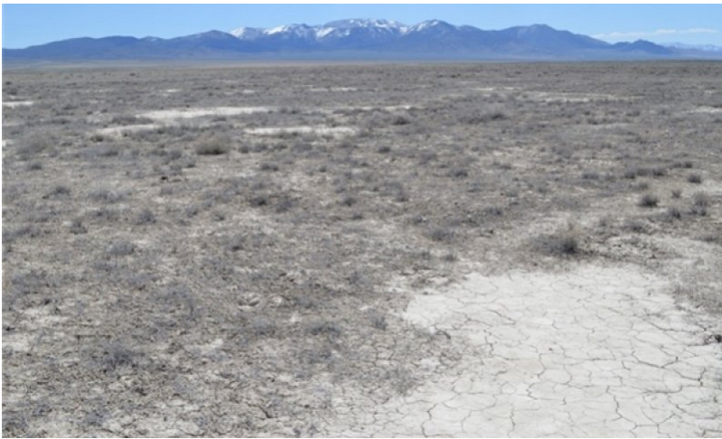
Figure 9. Alkali Silt Flat, T.Stringham April 2013, NV779 MU3271