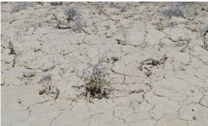
Figure 10. Alkali Silt Flat, T.Stringham April 2013, NV779, MU3271