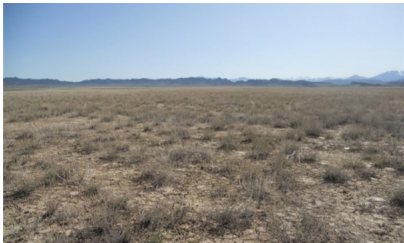
Figure 9. Saline Terrace 8-10", T.Stringham April 2013, NV779 MU3130

Perennial grasses like western wheatgrass and Indian ricegrass are reduced and the site is dominated by sickle saltbush, winterfat, shadscale and other shrubs. Annual non-native species may be present to increasing. Bare ground is significant.