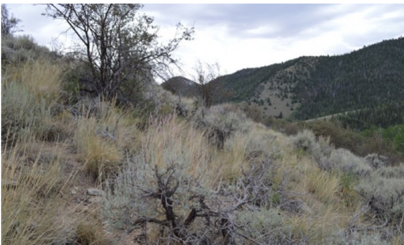
Figure 8. Shallow Loam 14+ (R028AY065NV) T. Stringham, August 2013

The plant community is dominated by bluebunch wheatgrass and mountain big sagebrush. Mountain snowberry is also common on this site. Potential vegetative composition is about 70% grasses, 10% forbs and 20% shrubs. Approximate ground cover (basal and crown) is 30 to 40 percent.