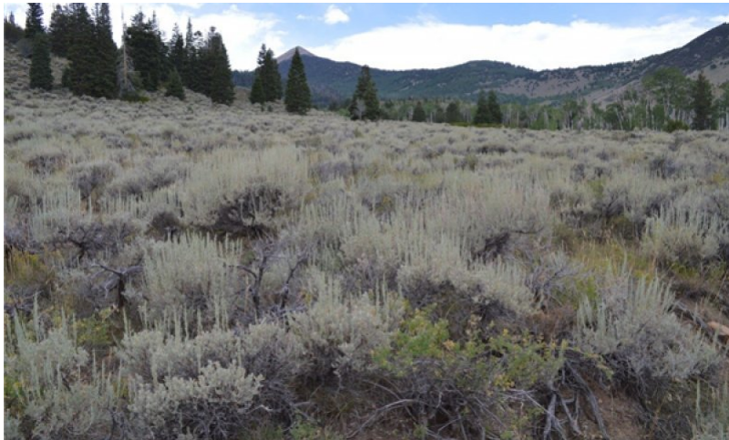
Figure 9. MU 5432 Shallow Loam 14+ (R028AY068NV). T.Stringham, August 2013

Mountain big sagebrush increases and the perennial understory is reduced. Decadent sagebrush dominates the overstory and the deep-rooted perennial bunchgrasses in the understory are reduced either from competition with shrubs or from grazing management. Perennial forbs such as mules-ear may increase with inappropriate herbivory. Non-natives are present.