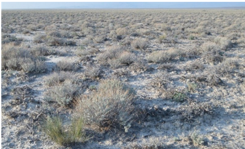
Figure 9. Loamy 5-8", T. Stringham September 2012, NV780 MU170

Shadscale and rabbitbrush increase while Indian ricegrass and bud sagebrush decline. Bare ground increases along with annual weeds. Prolonged drought may lead to an overall decline in the plant community. Sandberg's bluegrass grass may increase.