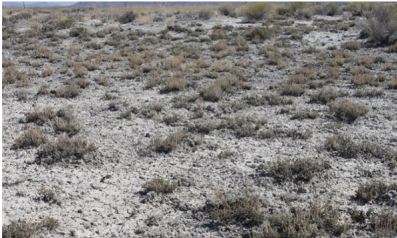
Figure 10. Barren Fan 8-12" (R028BY040NV) T.Stringham May 2012

Pygmy sagebrush and other shrubs increase while Indian ricegrass and needleandthread grass decline. Bare ground increases along with annual weeds. Rabbitbrush may increase. Prolonged drought may lead to an overall decline in the plant community.