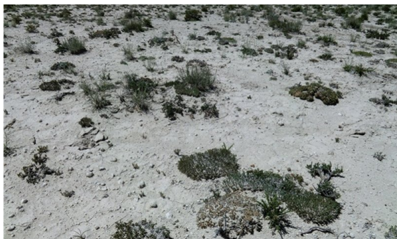
Figure 9. Barren Fan 8-12" (R028BY040NV) P. Novak-Echenique 6/5/2014

This community is dominated by pygmy sagebrush. Perennial bunchgrasses such as Indian ricegrass and needleandthread are decreased. Rabbitbrush may increase.