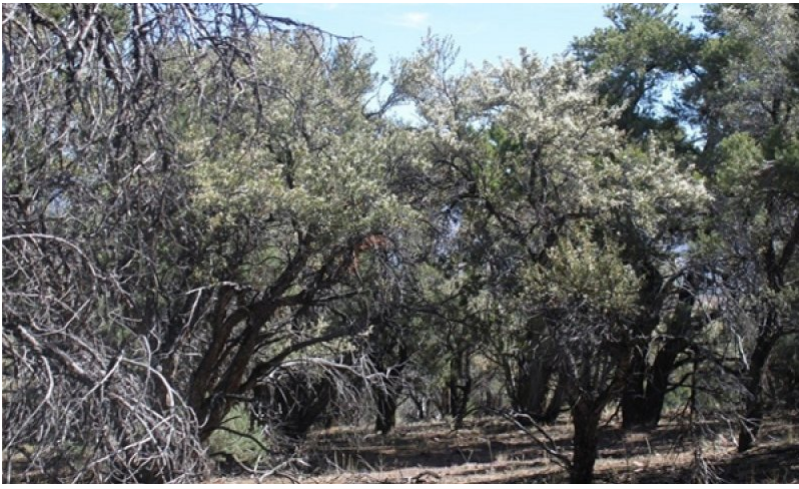
Figure 12. T. Stringham July 2012, NV780 MU770, Lithic Argicryoll

Singleleaf pinyon, Utah juniper, and mountain mahogany co-dominate this phase. The understory of shrubs and grasses is nearly intact but shows signs of thinning (Miller et al 2008). Mountain big sagebrush and snowberry are starting to show signs of increased competition from tree canopy and are decreasing in the understory. Muttongrass increases with shading and may be the dominant bunchgrass in the understory. Annual non-native species are present and may be increasing.