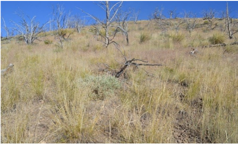
Figure 10. T. Stringham, July 2014, NV780, MU 851, Lithic Calcixeroll

This community phase is characteristic of a post-disturbance, early seral community where annual non-native species are present. Mahogany and sagebrush are present in trace amounts. Snowberry, ephedra and rabbitbrush are sprouting or increasing; perennial bunchgrasses may dominate the site. Annual non-native species are stable or increasing within the community.