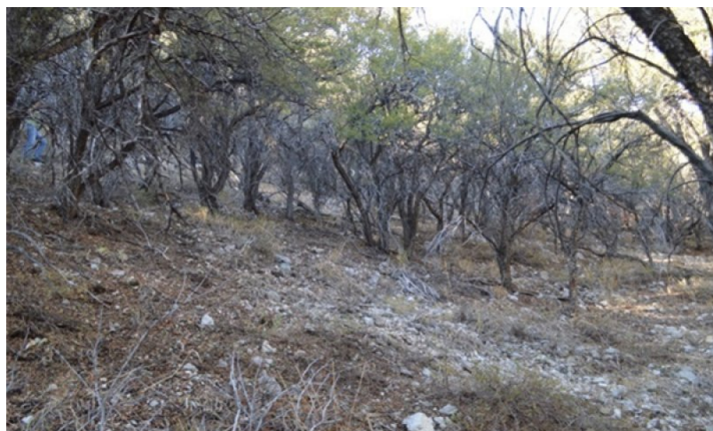
Figure 8. T. Stringham 9/2012, NV776, MU 451, Haunchee soil series

Mahogany density will increase in the absence of disturbance. Shrubs and deep-rooted perennial bunchgrasses will be shaded out by the dense mahogany. Muttongrass is more shade tolerant, however, and will still be found in the understory. Mahogany in dense stands will lose lower branches due to shading and/or herbivory, resulting in a more tree-like appearance. Scattered pinyon and juniper trees may be present and increasing on the site, however the mahogany and shrub understory is intact and is dominating site resources (Miller et al 2008).