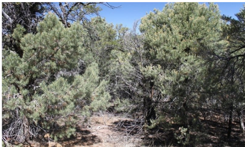
Figure 11. T. Stringham July 2012, NV789 MU 770, Lithic Argicryoll