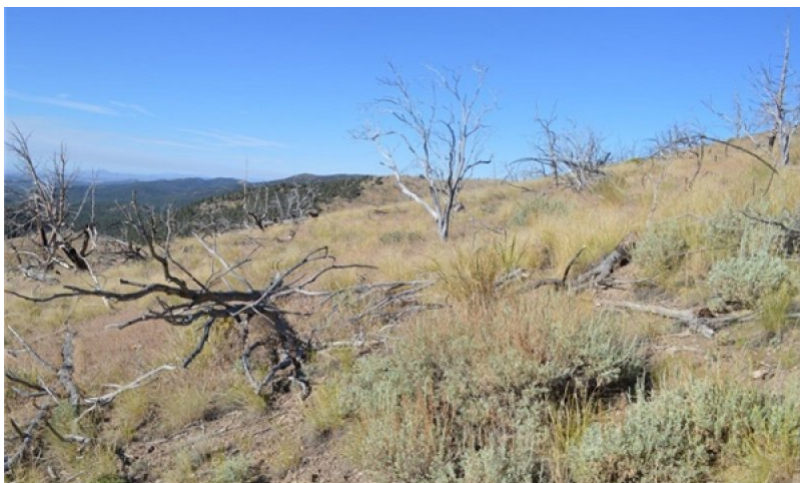
Figure 9. T. Stringham, July 2014, NV780, MU851 Lithic Calcixeroll