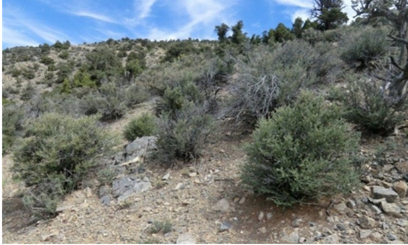
Figure 9. Limestone Hill (R028BY066NV) T.Stringham June 2013

This community phase is characterized by a dominance of littleleaf mountain mahogany. Black sagebrush and desert snowberry are common associated shrubs. Scribner needlegrass and Indian ricegrass are the dominant bunchgrasses in the understory. Bottlebrush squirreltail, bluebunch wheatgrass and Sandberg bluegrass are also present. Perennial forbs comprise a minor component in the understory. Annual non-native species are present in the understory. Utah juniper may be present in small amounts.