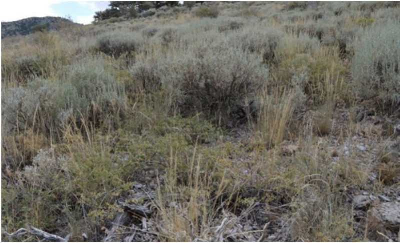
Figure 8. Mountain Loam 16\" (R028BY070NV) T. Stringham July 2012

The plant community consists of mountain big sagebrush as the major overstory shrub, with snowberry also common on this site. Bluebunch wheatgrass is the dominant understory species. Annual non-native species are now present in this community. Cheatgrass is the species most likely to invade.